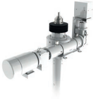
2000kN Shield Door Jack