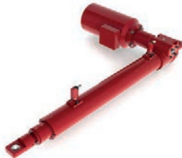
50kN Linear Actuator