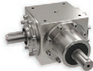
Stainless Steel Bevel Gearbox