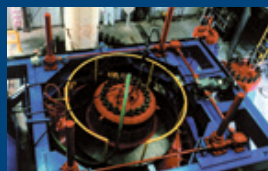
Test Facility - Lid Lift