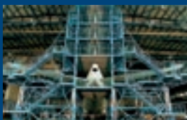
747 Maintenance Platform